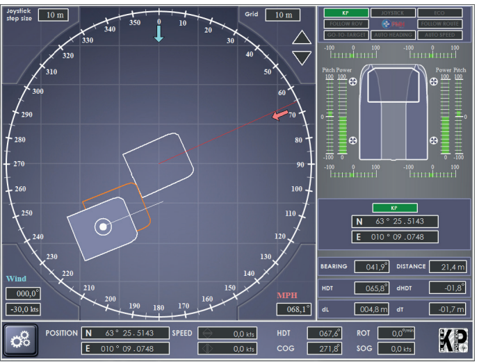
Operator display for KP-200 and KP-300

The KP-100 system is a dynamic positioning system with the most basic functions, for vessels without special requirements for extra features. KP-mode keeps your vessel in a desired position and heading, where the joystick lets you step your position in prefixed steps. Using Joystick-mode makes docking and maneuvering both quick and easy, as the KP system directs all propulsion and maneuvering equipment to move the vessel in the desired direction.