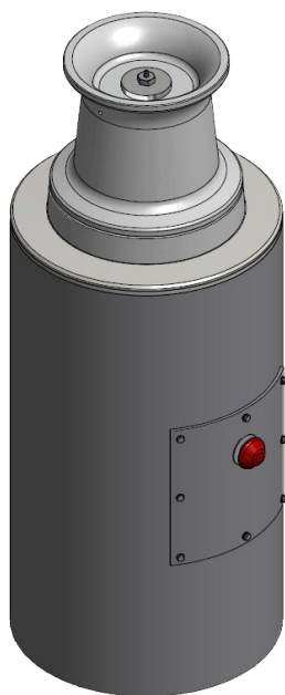
C2000D: Deck mounted 2 000kg capstan

The C2000R capstan is a rail mounted capstan with a bollard pull of 2000kg, ideal for cargo handling and tightening of mooring arrangements for fish farm facilities. The pedestal is available in either steel or aluminium, and can be either welded or bolted to the structure. This capstan is always delivered with an emergency release valve, to be mounted on the best accessible place for the operator.