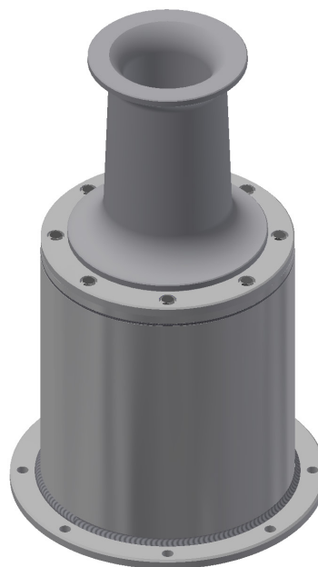
C3000D L400: Custom deck mounted 3 000kg capstan

PETTER'S MARINE HYDRAULICS has also developed and delivered customized capstans based on customer's design requests. The C3000D L400 capstan is a custom made deck mounted capstan with a bollard pull of 3 000kg. This design has a prolonged capstan head with a height of 400mm and prolonged diameter on the capstan housing. This capstan is always delivered with a mounted emergency release valve.