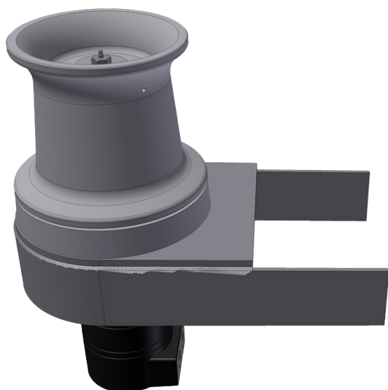
C2000R: Rail mounted 2 000kg capstan

conditions, providing EXCELLENT performance and high RELIABILITY in a COST EFFICIENT way. The C2000D capstan is a deck mounted capstan with a bollard pull of 2 000kg, ideal for cargo handling and tightening of mooring arrangements for fish farm facilities. The pedestal is available in either steel or aluminium, and can be welded or bolted to the structure. This capstan is always delivered with a mounted emergency release valve.